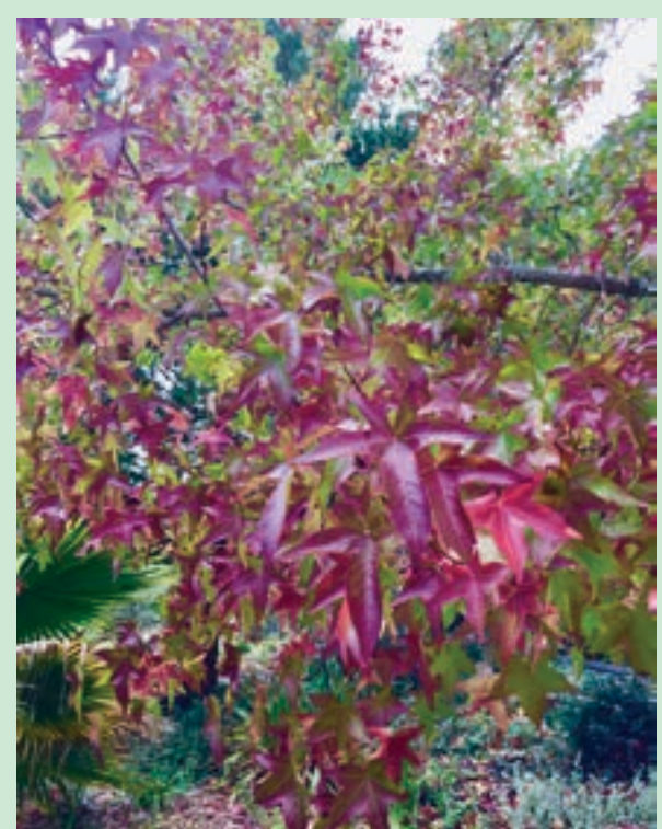
Remarkable intricacy in a close up look at Liquid Amber leaves.

925-376-6528 advancetree@sbcglobal.net www.advancetree.com